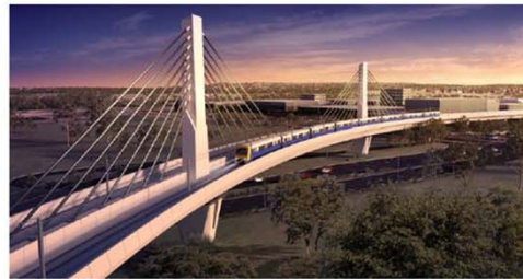
Rouse Hill, NSW – master planning underway