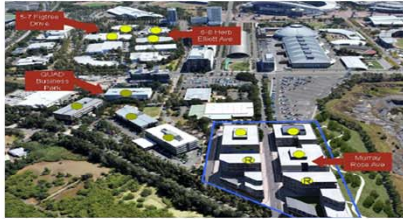
Sydney Olympic Park, NSW