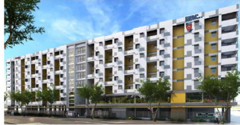
Casuarina Square, NT – completion 1H 2015