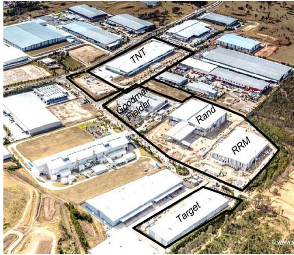
Erskine Park, NSW