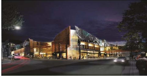
Wollongong Central, NSW – completion 2H 2014