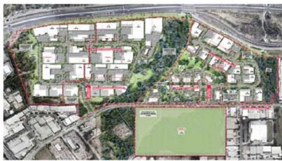
Metroplex, Wacol, QLD