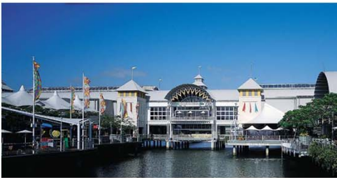
Sunshine Plaza, QLD – master planning underway